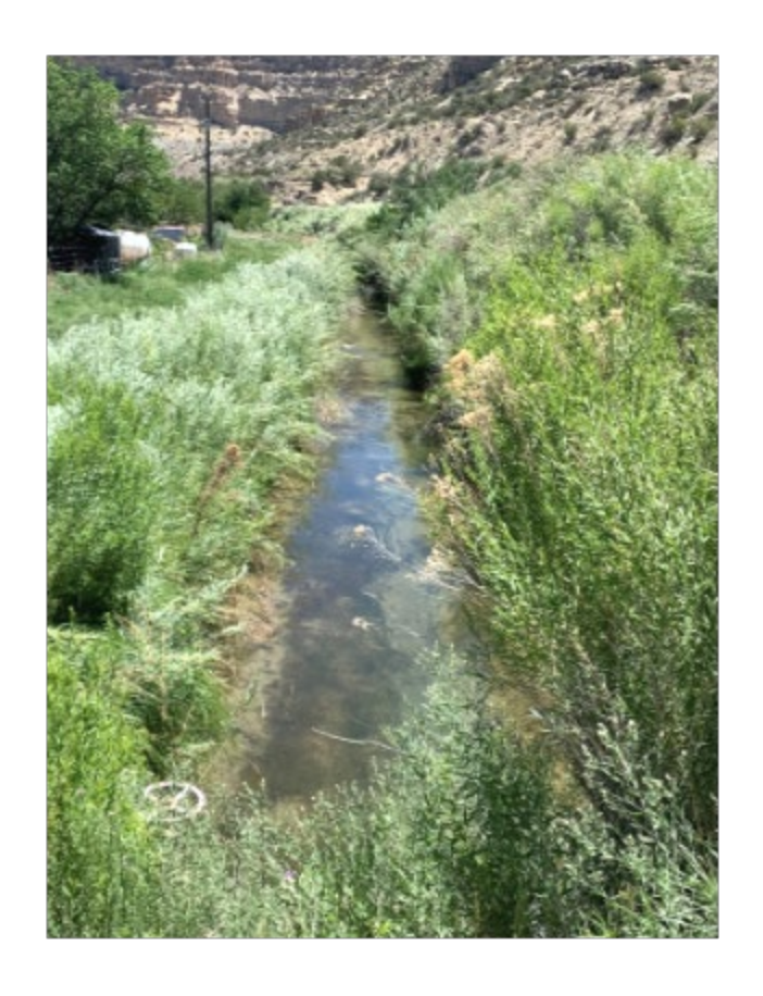
U. S. Army Corps of Engineers Albuquerque District